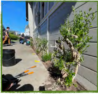
In situ olives, unaware of their fate