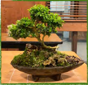
Bruce Broyles– Kingsville Boxwood