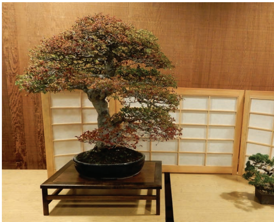
Chinese Elm ( Ulmus parvifolia )

REBS Show & Tell taken on September 22, 2022, Garden Room, Rohnert Park Community Center.