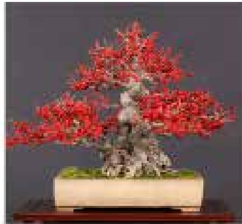
Jeff Steen - Red Sorbus

GSBF Bonsai Rendezvous will include a sales area that is open to the public, offering plants, tools, pots, etc.