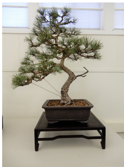
Austrian Black Pine