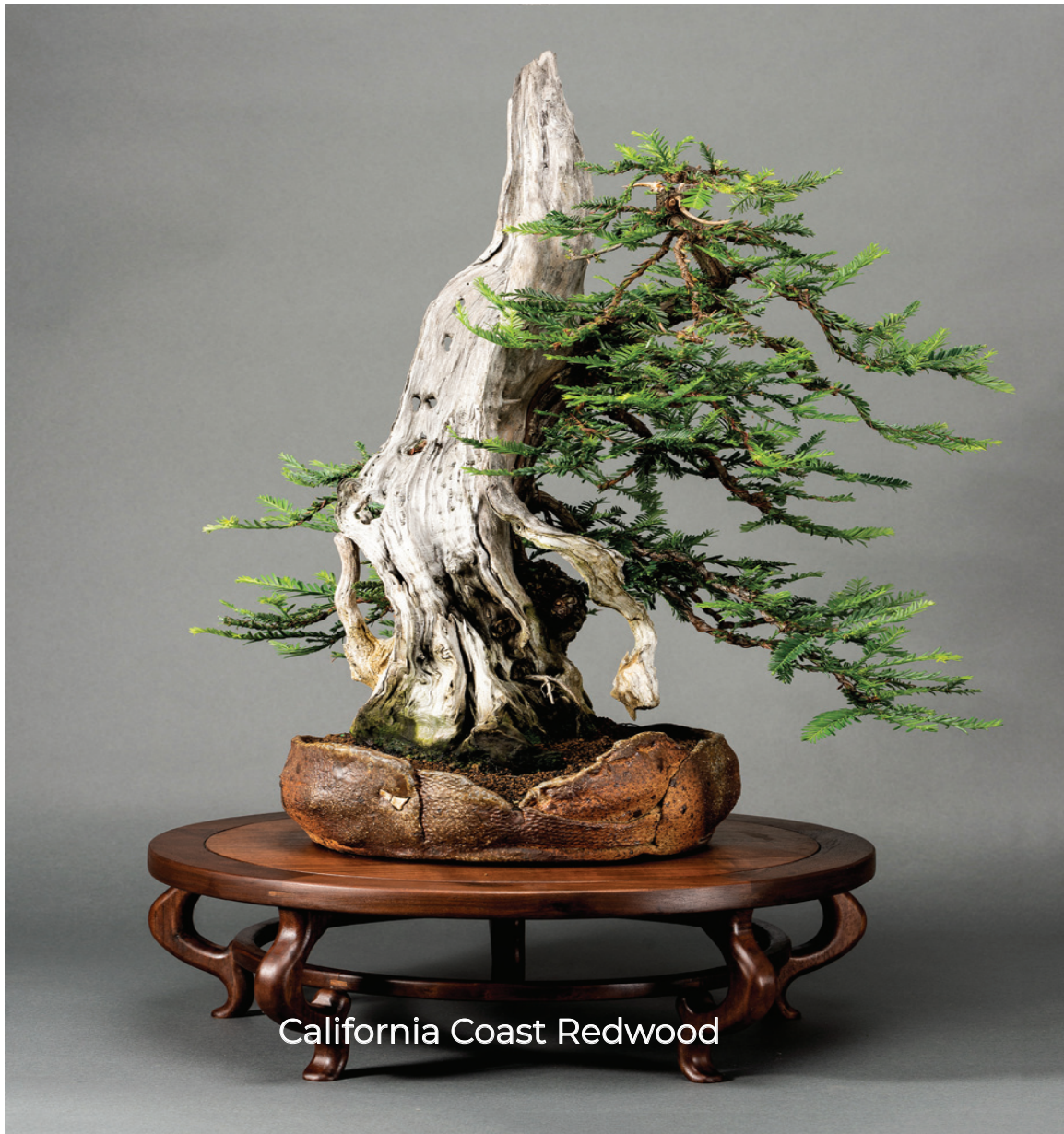
California Coast Redwood

Want to feature your bonsai in the upcoming REBS newsletters? Just email an jpeg or png image, 300 ppi high resolution, to the Newsletter Editor prior to the end of the month.