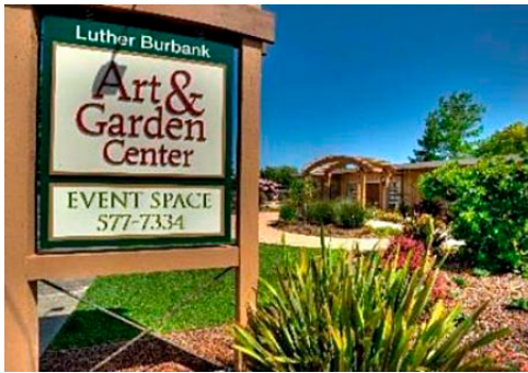
Luther Burbank Art & Garden Center, Santa Rosa, California

REBS was founded in 1981 for bonsai enthusiasts. Our club meets every fourth Tuesday of the month (except in July and December). The monthly meeting and demonstration are held at the Luther Burbank Art and Garden Center, 2050 Yulupa Avenue, Santa Rosa, 95405. Meetings are open to the public. Please refer to our calendar of events for specific time, date and guest demonstrator.